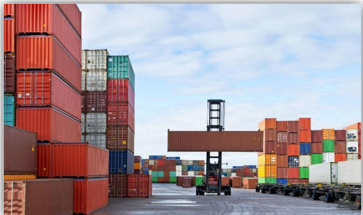
Teamster at Coast 2000 operating a Container Reach-Stack Machine

The Teamsters protect and advocate on behalf of the truckers, lumber transload workers, warehouse and off-