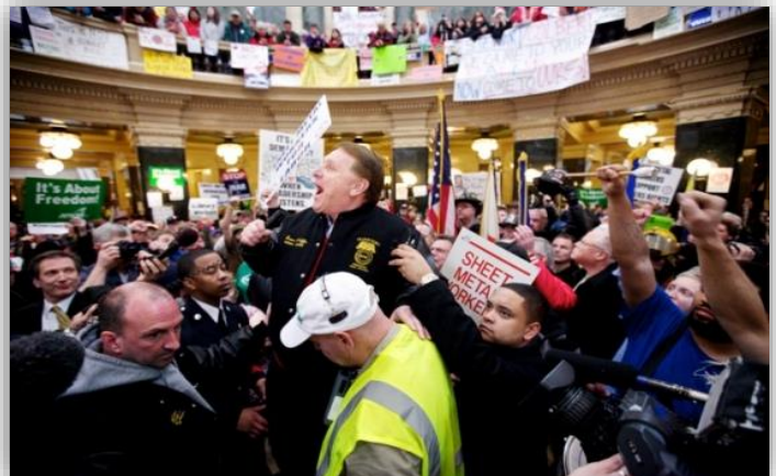
General-President, James P. Hoffa Marks 20 Years as the Leader of the International Brotherhood of Teamsters

Continuing the report, General-President, James P. Hoffa marked an important milestone in Teamsters history to become only the second General-President to log 20 years as a head of the Teamsters Union. Over the course of those two decades, the Teamsters have regained their mantle as the strongest union in North America through rebuilding its finances, organizing the unorganized and negotiating the strongest contracts in labour.