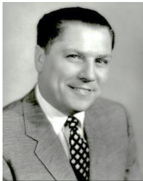
General-President Emeritus, James R. Hoffa

“Don’t let any man into your cab, your home, or your heart, unless he’s a friend of labour.”