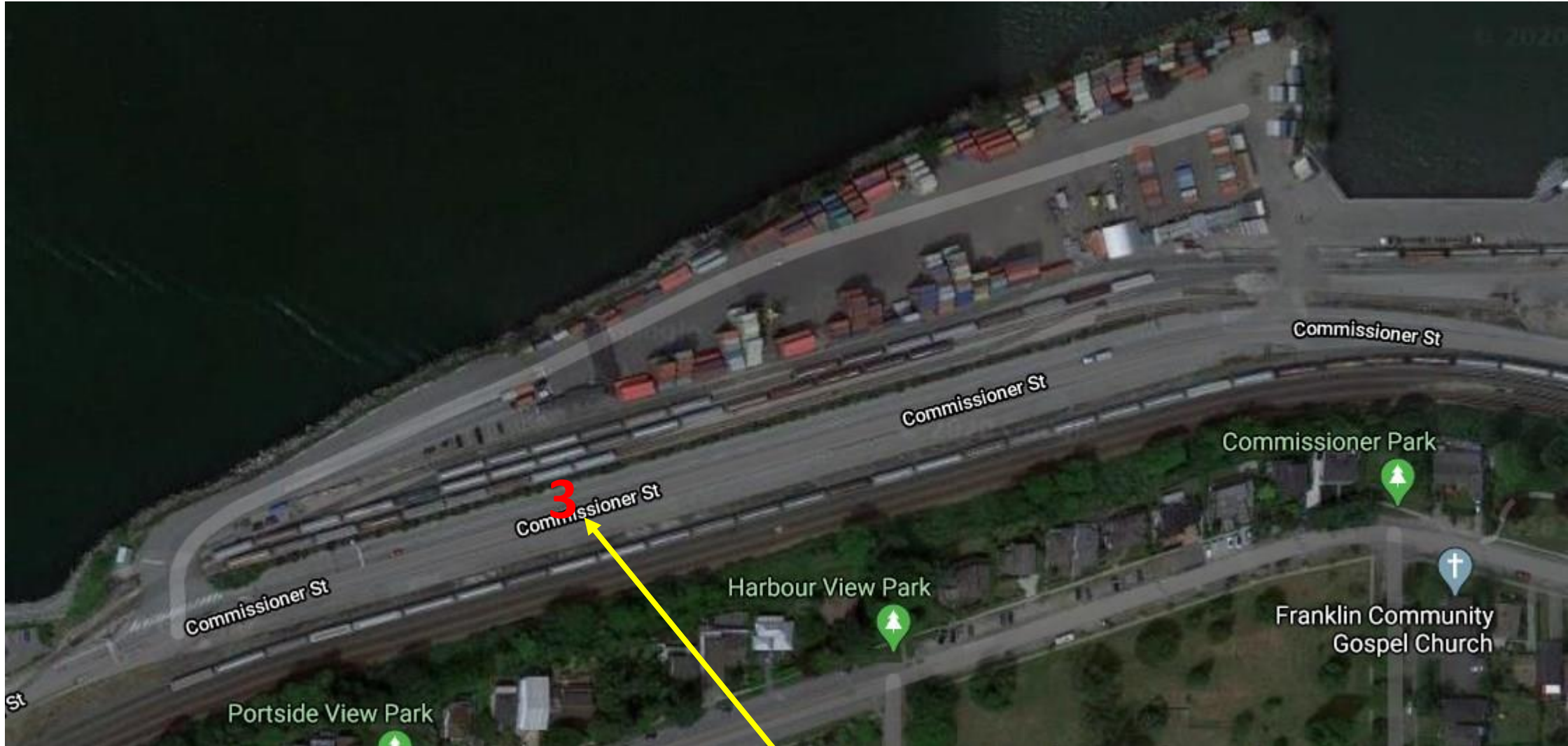
North Lane of Commissioner Street – Truck Staging Lane